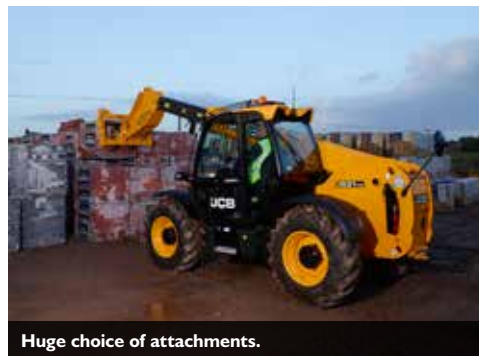
Huge choice of attachments.