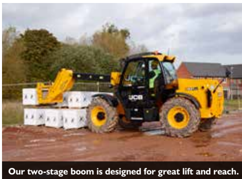
Our two-stage boom is designed for great lift and reach.