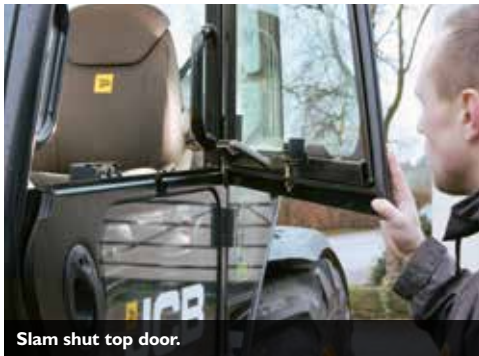
Slam shut top door.