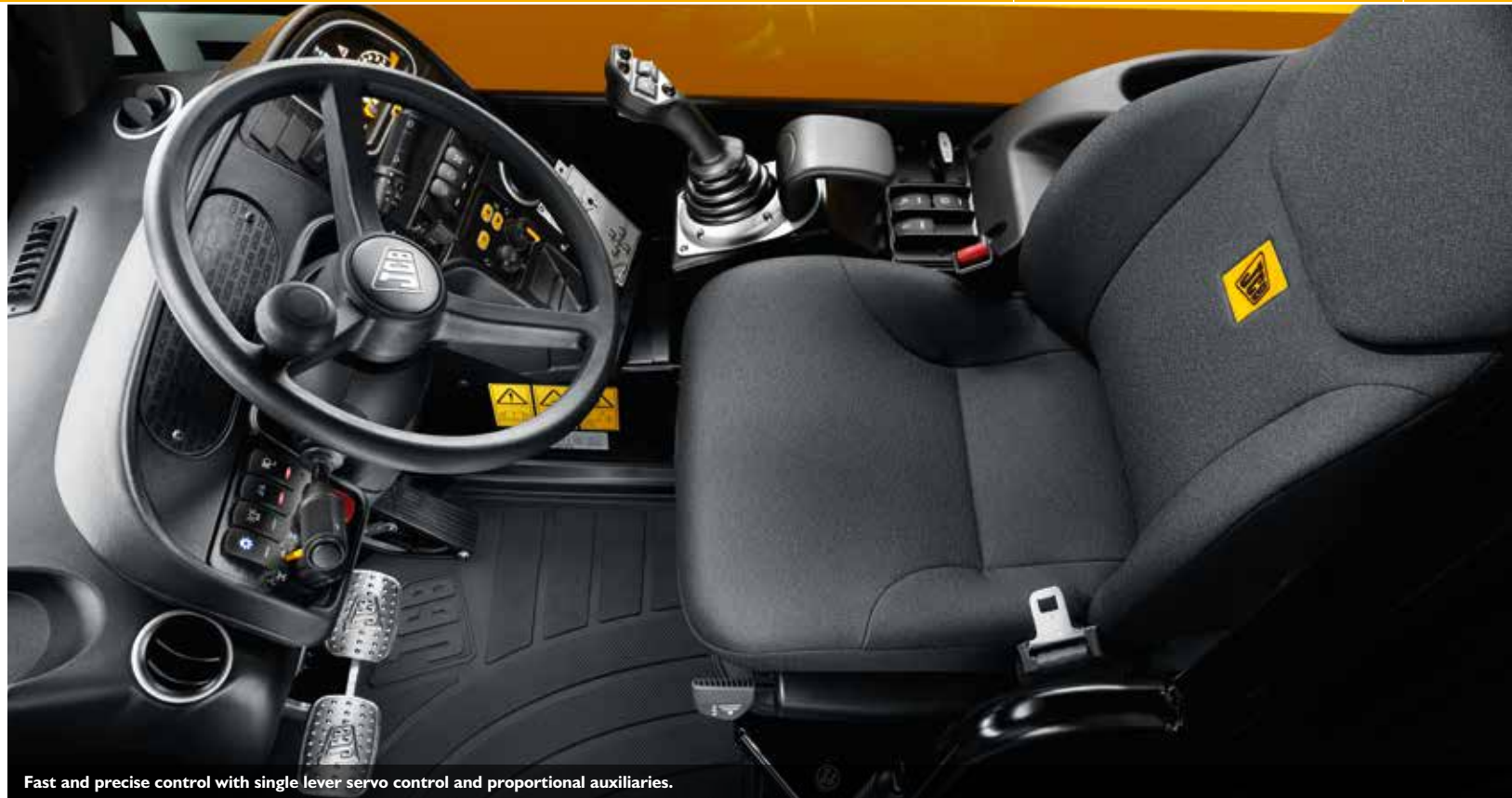
Fast and precise control with single lever servo control and proportional auxiliaries.