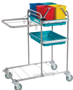
80813 EasyCar office