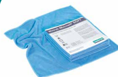
82142 Microwit SOFT blue