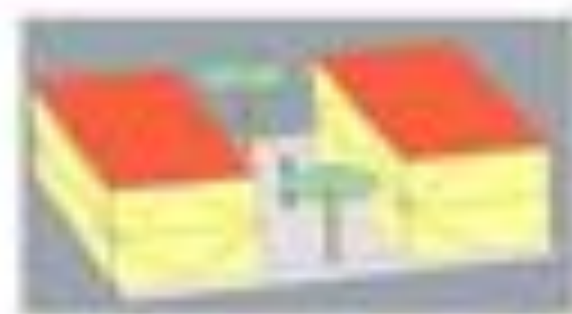
CitySim. Energy model and greening design