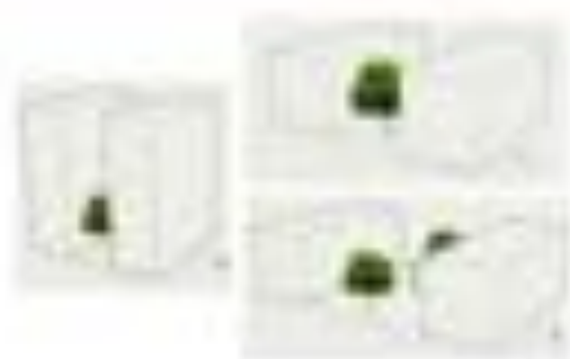
Geometrical model (GIS, DWG, GML..)