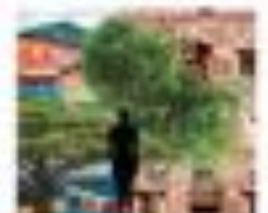
Thermal comfort, greening, energy demand and optimization