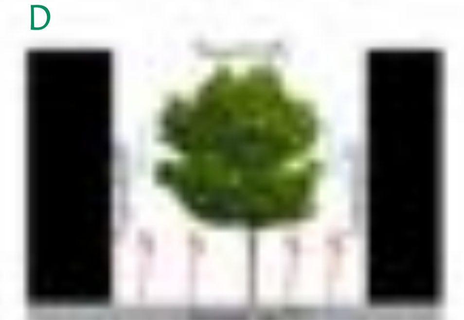
D. Thermal behaviour during a summer evening (20:00 hours)