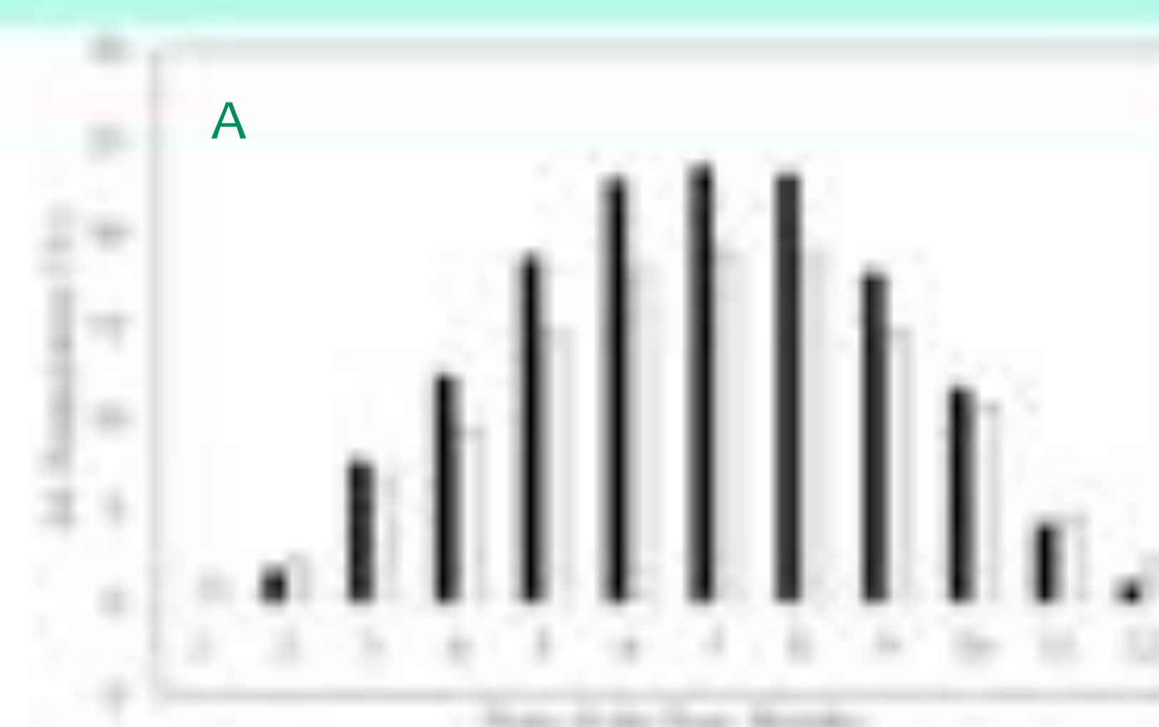
A. Averaged air temperature for a Typical Meteorological Year (TMY) and the Canopy Interface Model (CIM) July: 23.7°C CIM and 19.1°C TMY

Turbulence within the canyon (C): evening, sunny days