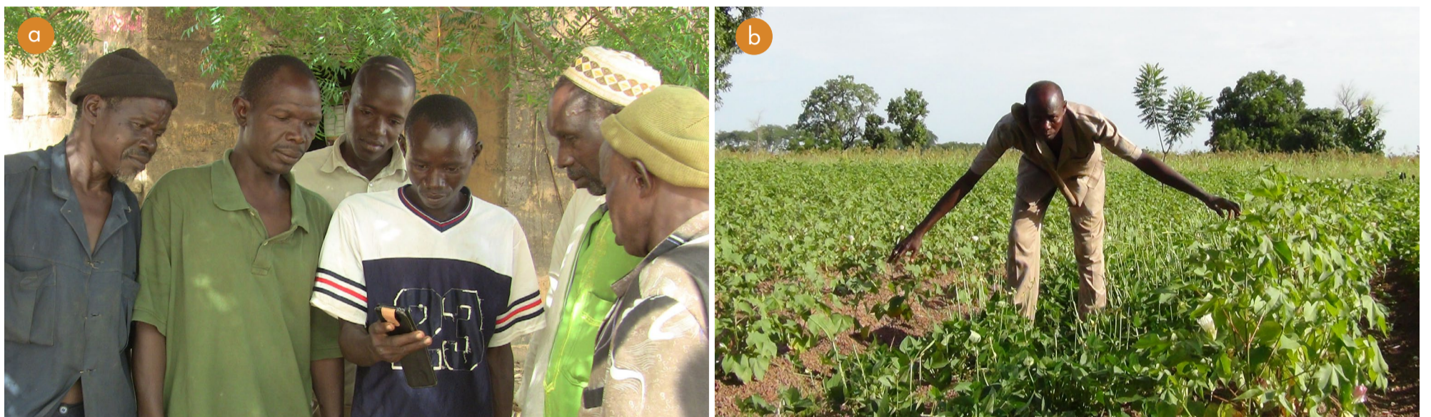
Fig. 1: Farmers in Touna, Mali, watching an agricultural learning video (a) and a cotton farmer points to the differences between the plot he fertilized using uniform application of compost, to the left, and the plot where compost was applied in pockets, to the right (b).