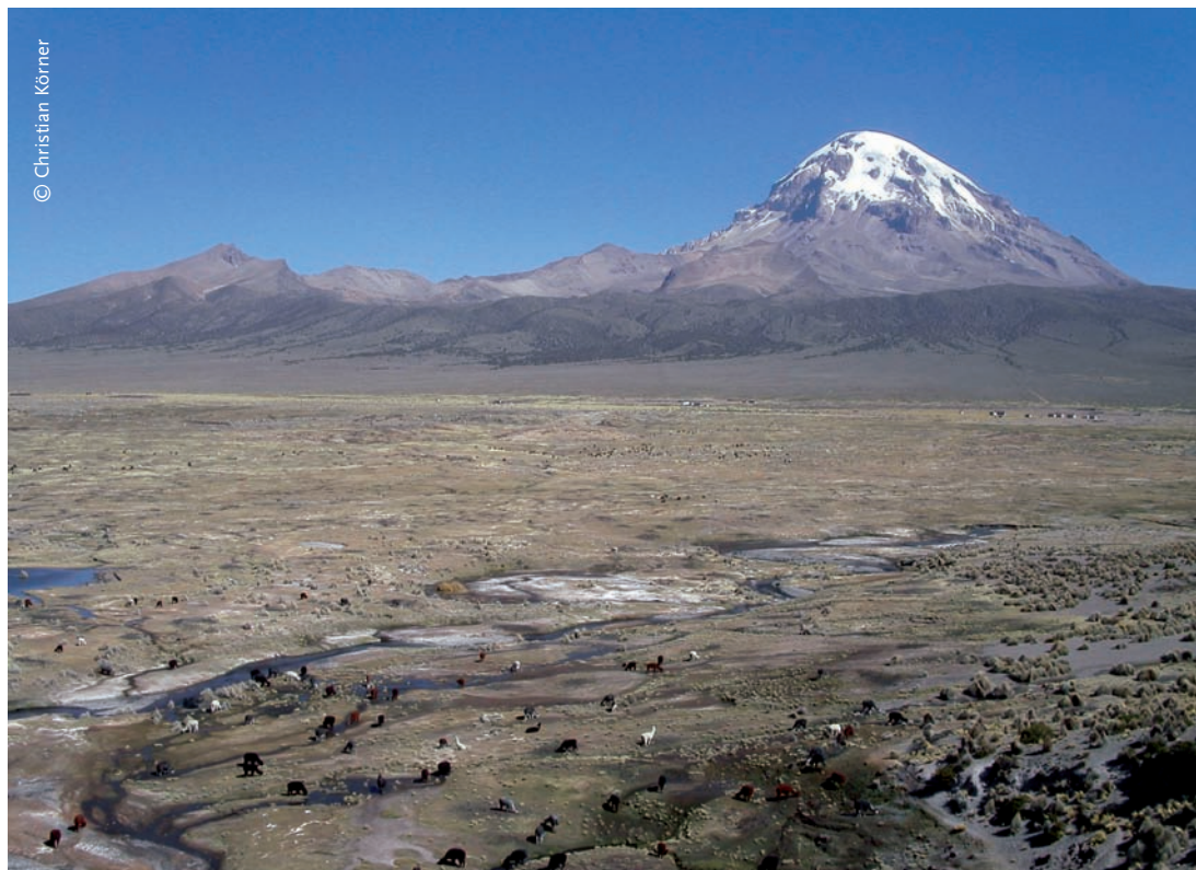
FIGURE 3: Sajama National Park in the Bolivian Andes: Transdisciplinary research on complex societal issues – such as sustainable development in mountain areas threatened by global change – may trigger innovation in disciplinary social or natural sciences. It may also lead to new research pathways beyond classical disciplines.