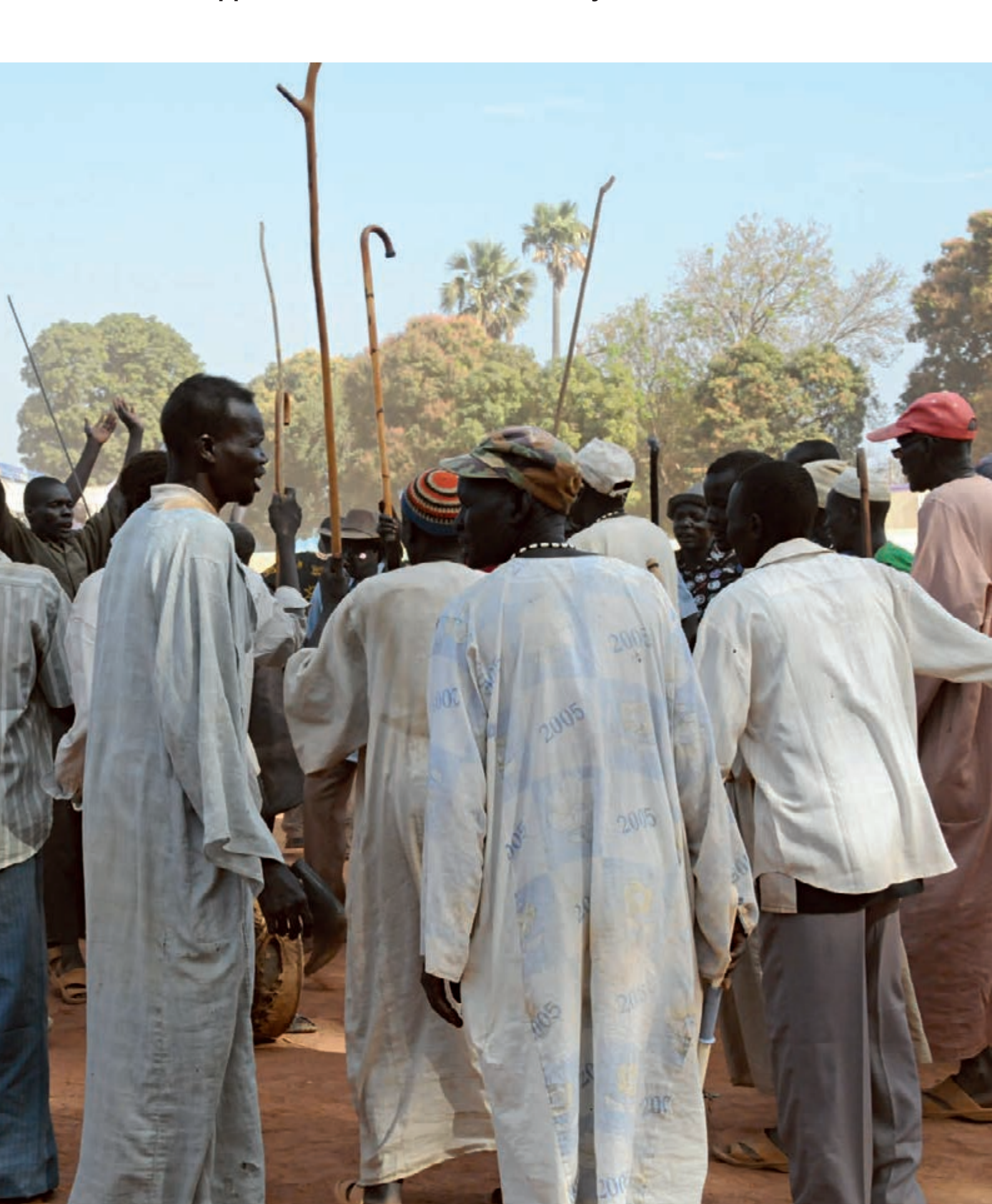
Part 1: Theoretical Application of Conflict Sensitivity to Field Research