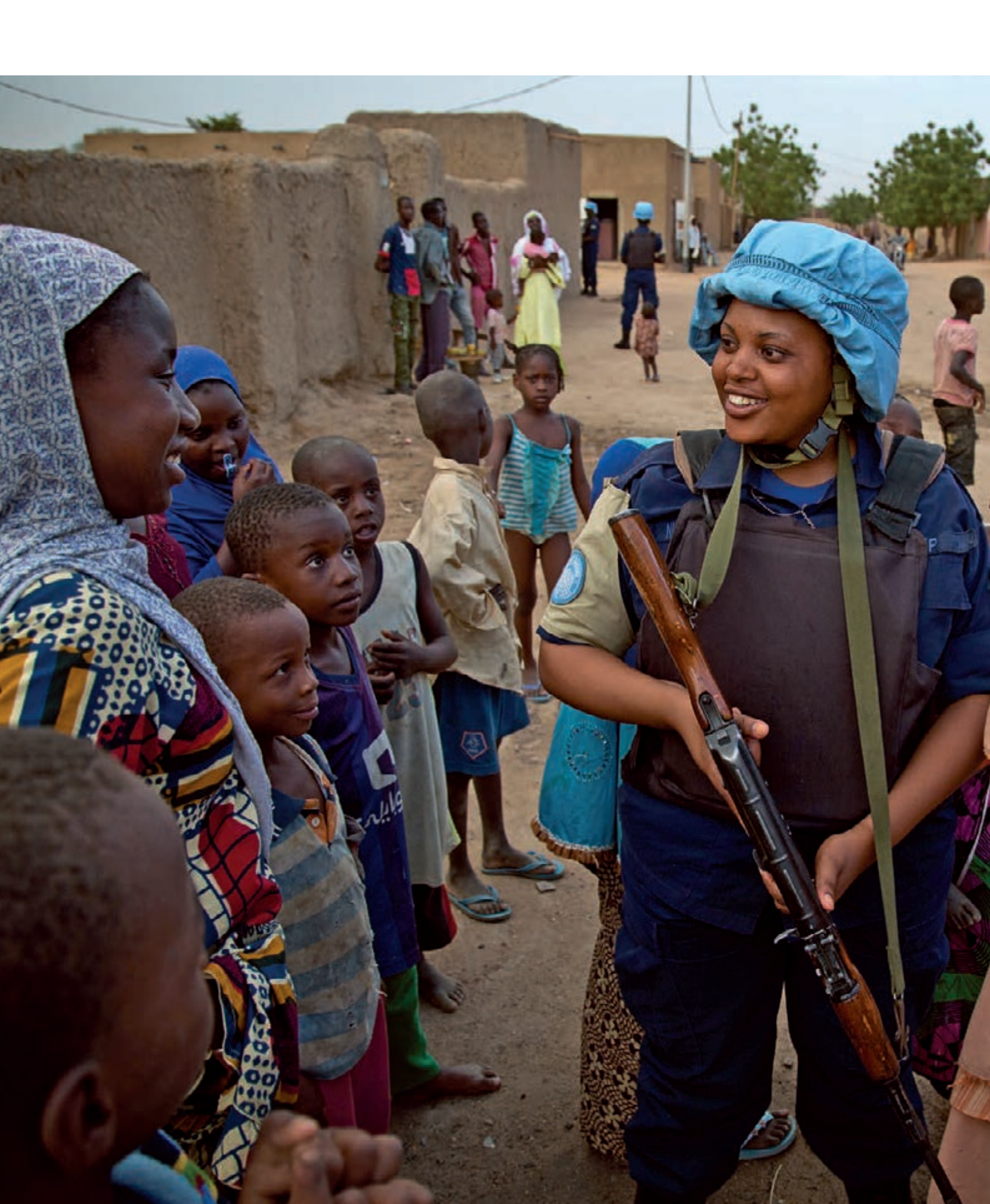
Part 2: How Field Research Influences Local Context