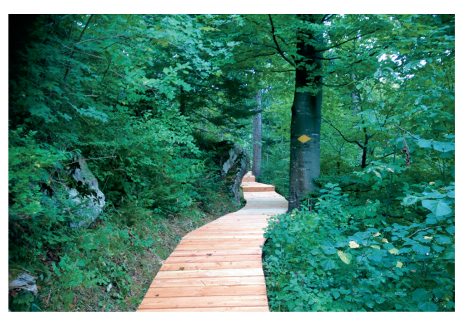
The "Holzweg Thal" ("Thal Wood Trail") was initiated by wood processing businesses based in the Thal Nature Park. Today, they run the project jointly with Region Thal, several municipalities and citizens' communities, the local forest owners' association, and the Thal forest service.

To avoid such situations, it is crucial that management centres work together closely with actors from the outset of regional development strategy drafting, and that actors not only contribute ideas, but also show interest in actively supporting and implementing future projects. Wherever possible, management centres should try to obtain binding commitments from potential project partners and project implementers already during the process of strategy development.