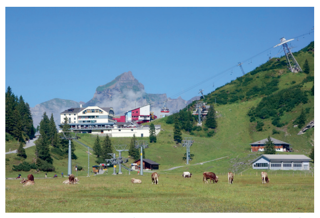
Regional development agencies face diverse expectations. Is it possible to find a common pathway?

It is therefore important that the tasks of members in the various boards and committees are clarified early on, and that responsibilities are documented. Who has which decision-making power must likewise be clarified. The significance of a clearly formulated mandate should not be underestimated.