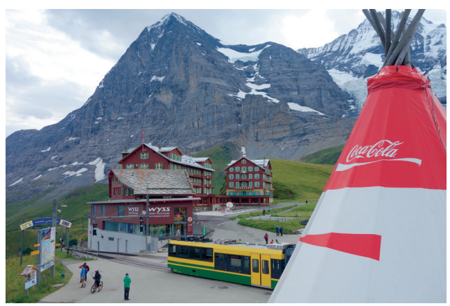
International brands dominate advertising. What do we need to improve the marketing of regional products?

By contrast, many regional development agencies - especially associations of municipalities implementing the New Regional Policy - have broadly formulated regional development strategies (cf. Inderbitzin and Hauser, 2016). Such strategies are largely limited to general goals and non-binding visions. They frequently lack both a concrete time frame and clearly formulated measures for action. Projects are either only roughly outlined or not described at all. Broadly worded development strategies are often readily and rapidly approved, precisely because they describe approaches in general terms (e.g. "Promote the region's competitiveness"), remain non-binding, and leave many – potentially conflictual - matters (e.g. project funding or questions of responsibilities) unresolved. However, the general nature of the goals formulated, their non-binding character, and the lack of concrete measures for action can make such strategies difficult to implement.