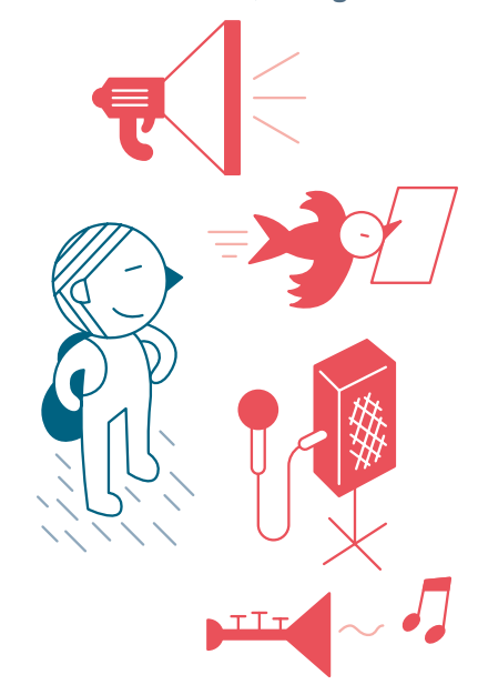
"Researchers need to take an increased responsibility for the impact of the disclosure of opinions."<sup>34</sup>

Communicating research design or data may have an impact on the research context. The question is how to factor this potential effect into your communication strategy. Conflict sensitive communication considers managing expectations and contributing to a sustainable network (important for future research), data security and anonymization, ownership of research results and open access regulations. These aspects are common issues in research but may become particularly pertinent in conflict contexts. For example, leaking sensitive data could lead to the escalation of a conflict or the perception of 'extractive' research<sup>35</sup> could reinforce 'colonial' structures in a conflict-prone area. These issues should be clarified early on, taking all research participants into account.